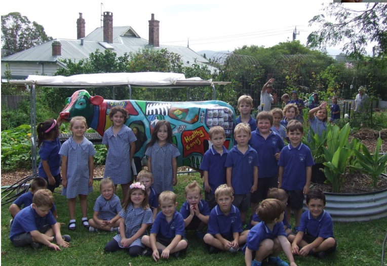
An oldie but a goodie - students in the garden