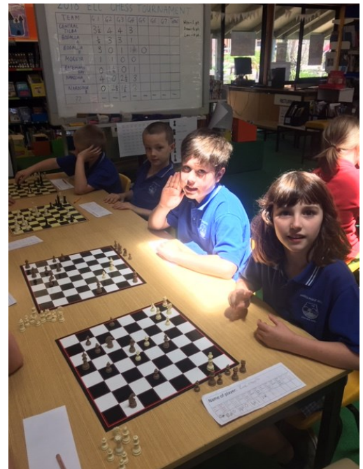
Moruya Public School chess team