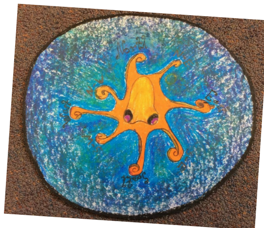
Here are some of their wonderful entries in the Little Sellers Art Prize Competition.