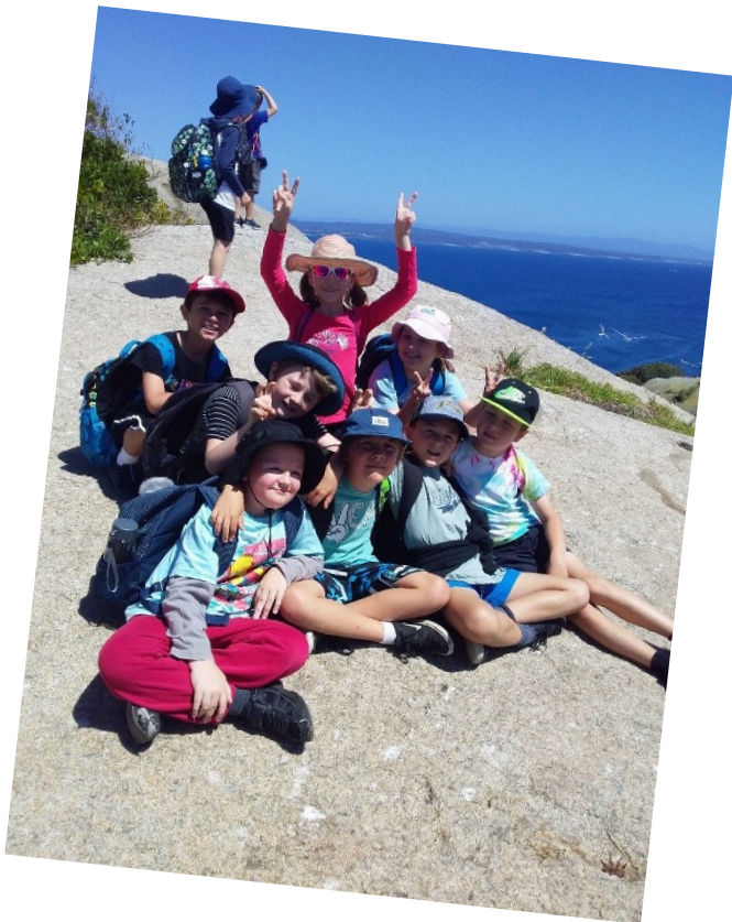
Year 2 Students and Teachers